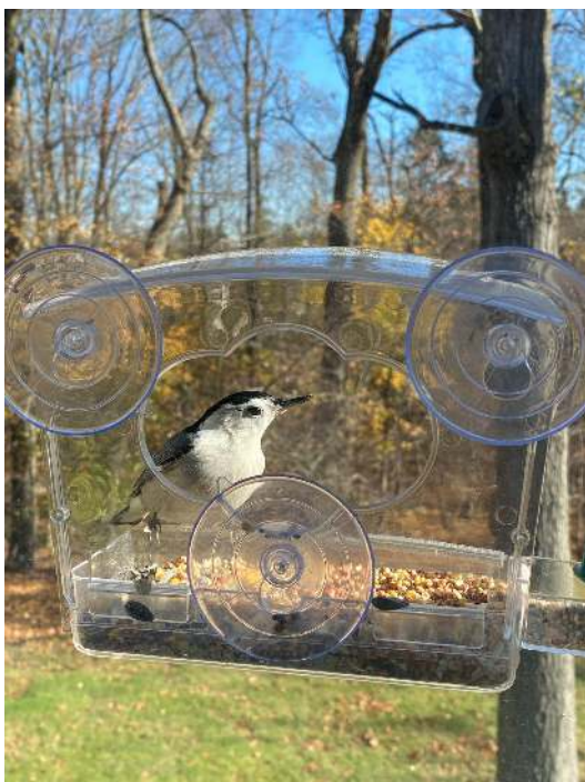
White Breasted Nuthatch

BIRDING! The Transition class installed two bird feeders on our third floor classroom windows this Fall. We've been watching to see what Avian visitors come to feed. So far we have observed the following: Tufted Titmouse, Black Capped Chickadee, White Breasted Nuthatch, Blue Jay, Red Cardinal, and Red Breasted Woodpecker. As we observe, we note that most seem to prefer black oil sunflower seed and dried corn kernels over millet.