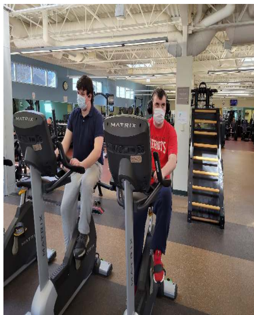
Two Matthew's Ride