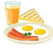
Importance of Breakfast