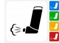
Controlling Your Asthma