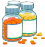
Medication Storage and Disposal